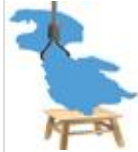
Strangulation of Lake Urmu